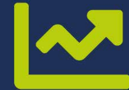
COMMERCIAL & RESIDENTIAL INVENTORY