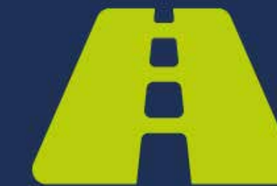
120' & 60' FOOT WIDE ROADS